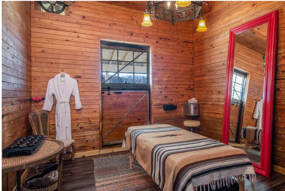
Housed in a soulful yet stylish converted barn, The Stable Spa promises to bring an unparalleled wellness experience to match its peaceful, natural setting.

The property offers more than 15,000 square-feet of combined indoor space and limitless outdoor space—making it easy to accommodate events of all sizes. There are horse stables located on the grounds, as well as friendly farm animals, making it the ideal sanctuary for animal lovers.