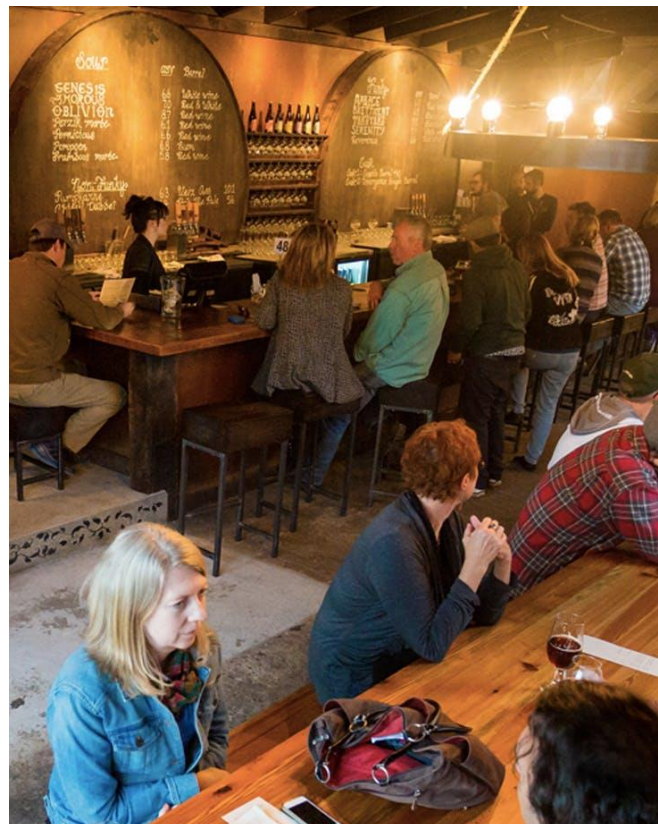
WICKED WEED BREWING

Down the most-talked-about scenic route in the United States—The Blue Ridge Parkway—and bonus points if you rent an old-school convertible for the outing.